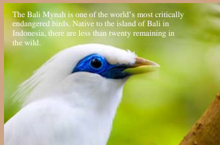
The Bali Mynah is one of the world's most critically endangered birds. Native to the island of Bali in Indonesia, there are less than twenty remaining in the wild.

Sources: Cites website; UNEP/WCMC's Tree Conservation Information Service.